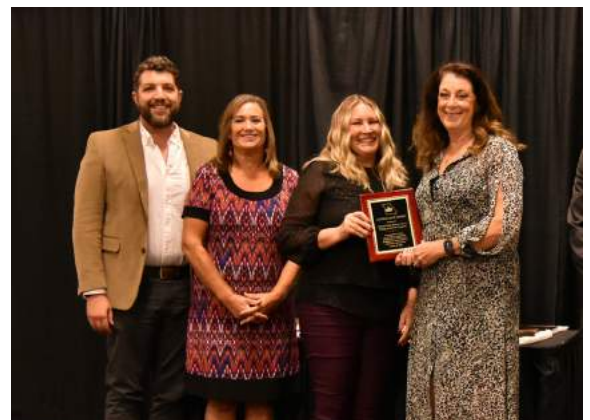
ORCHARD FARM SCHOOL DISTRICT

The Orchard Farm School District has developed the Bridge to Success Program, a county-wide transition program that focuses on vocational skill building for students with disabilities. The Bridge to Success offers students the opportunity to participate in a hands-on learning experience during the school day. Similar to a technical school, students get to learn skills needed for post-secondary success, such as employability skills, social skills, independent living skills, etc. Orchard Farm works in partnership with two other St. Charles County school districts, Francis Howell, and the City of St. Charles, as well as The Center for Head Injury Services and the Developmental Disabilities Resource Board to customize a program that already exists to promote various vocational education experiences for students across the community.