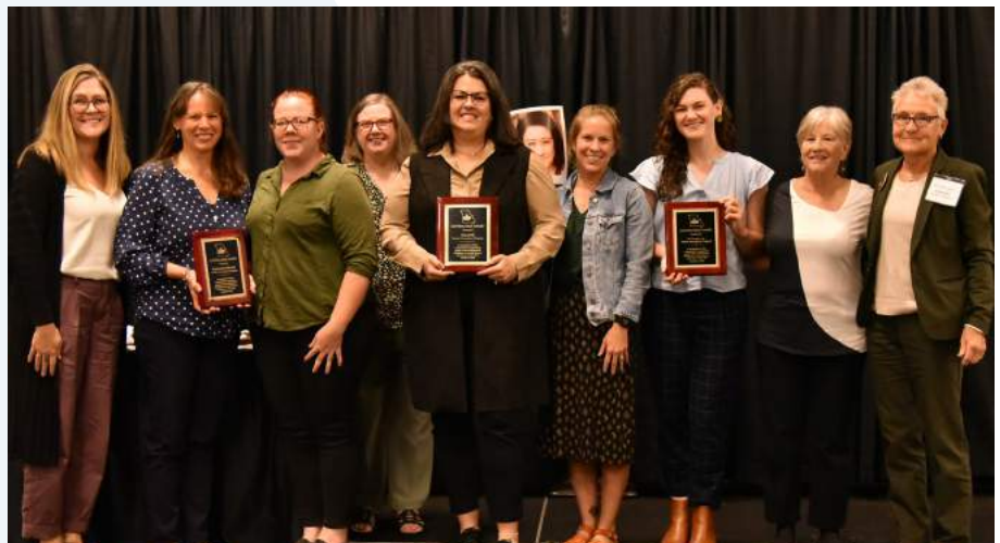
FAMILY NAVIGATION PROGRAM

the community and other providers about the service they provide and how they can collaborate with them to best support individuals/families. Supports provide individuals and/or their families the tools and knowledge to navigate the system as independently as possible in the future. The Family Navigation Program has led to more interdependence and independence, building skills that will serve its participants far into the future.