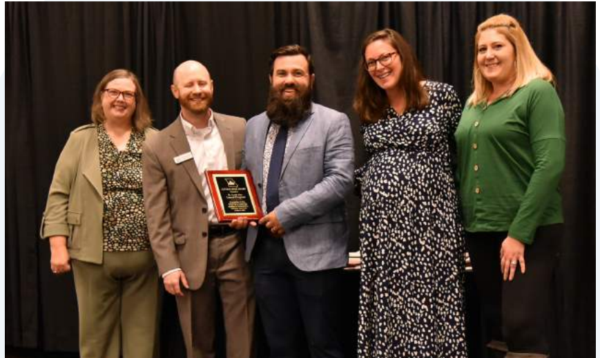
ST. LOUIS ARC LAUNCH PROGRAM

The St. Louis Arc Launch Program offers a suite of services and supports for youth and their families to assist them in planning for a successful future as they approach adulthood. Designed for teens and young adults between the ages of 16-25 who have a goal of living independently, continuing their educational interests, building relationships, and making connections in their community, the program was based on research and best practices with an emphasis on self-determination, goal setting and motivation, family involvement, and access to resources, which all contribute to successful transition for young adults with IDD and Autism.